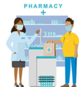
In-person HIV tests

Knowing your HIV status helps you make healthy decisions to prevent getting or transmitting HIV.