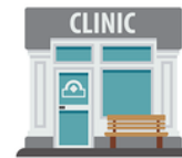
Free or low-cost tests

Many HIV tests are quick, free, and painless.